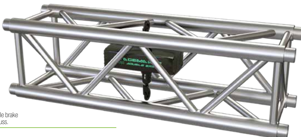
Stagemaker SR1 double brake fits perfectly in a 12" truss.