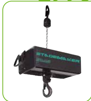
Launch of the STAGEMAKER SM range