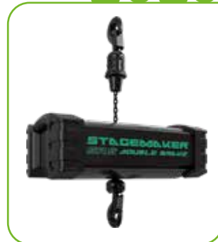
Launch of the STAGEMAKER SR range