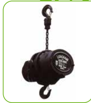
Launch of Europe's first inverted, electric powered hoist, the LITACHAIN L104 range