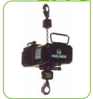
Launch of the LITACHAIN LI 5 & LI10 range