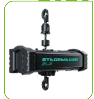
Launch of the STAGEMAKER SL range

STAGEMAKER has an excellent global reputation with more than 45 years of experience in the entertainment rigging market as well as theaters, studios, events, trade show,... Our long life span, together with our impressive customer references, proves our commitment to this market and the reliability and ingenuity of our products.