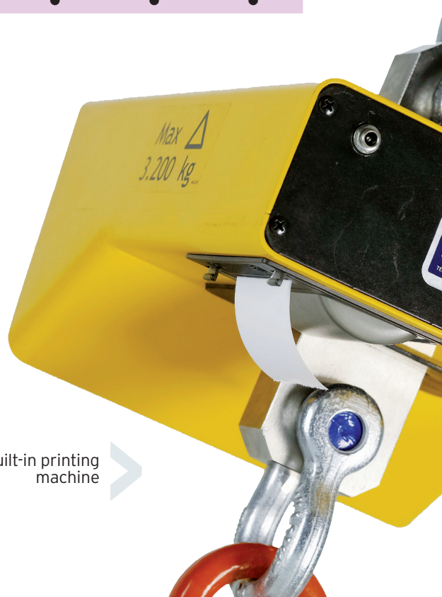
Built-in printing machine